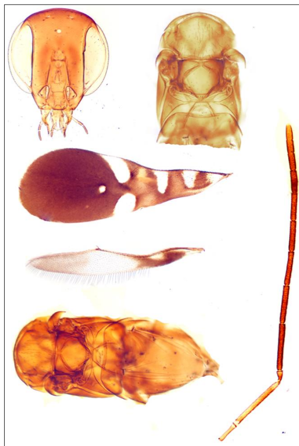
Fig 6-11: Callipteroma sexguttata , 6. head, 7. mesosoma, 8. forewing, 9. hindwing, 10. mesosoma and metasoma, 11. antenna