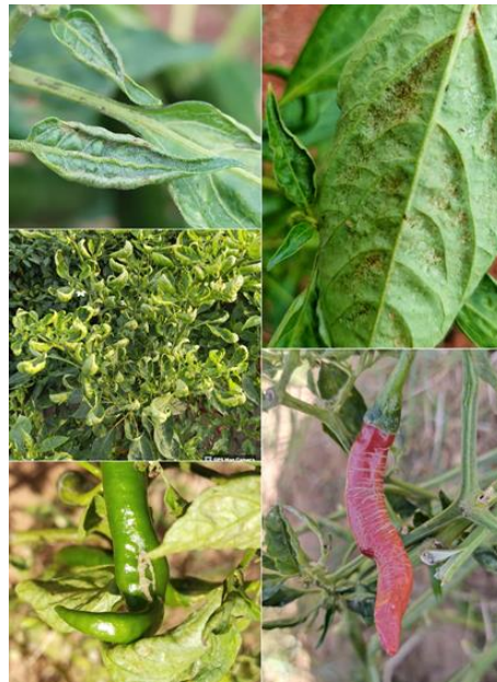
Plate 2: Thrips damage on chilli leaves and fruits

Recently an outbreak of invasive thrips species, Thrips parvispinus , is observed in chilli growing areas of southern India during 2021-22. It was first noticed in Guntur district of Andhra Pradesh during January, 2021 and subsequently its spread was noticed in all chilli growing areas of Andhra Pradesh (Sireesha et al. , 2021) [24]. This was also observed in the chilli growing districts of Telangana (Kumari et al. , 2021) [10] and Karnataka during November and December of 2021 (Nagaraju et al. , 2021) [15]. Subsequently this invasive thrips species has dominated and displaced the well-established chilli thrips, S. dorsalis which was a regular pest on chilli (Sridhar et al. , 2021) [25]. An attempt was made to documentation of invasive thrips, T. parvispinus and their natural enemies in major chilli growing districts of Karnataka.