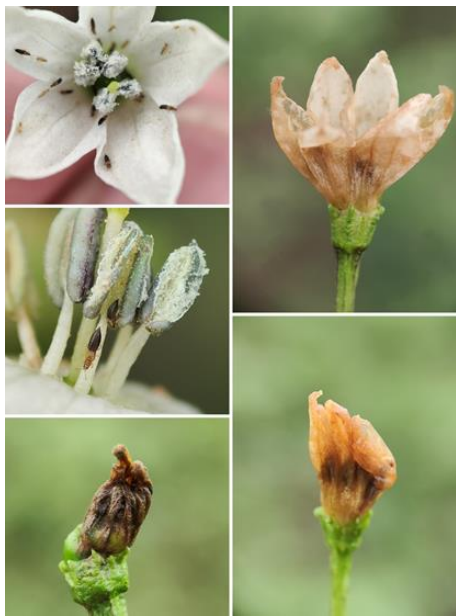
Plate 1: Thrips Damage on Chilli Flower

A total of eight species of thrips have been reported infesting to chilli crop in India. These species were Thrips parvispinus (Karny), Scirtothrips dorsalis (Hood), Frankliniella schultzei (Trybom), Thrips florum (Schmutz), Thrips hawaiiensis (Morgan), Thrips palmi (Karny), Thrips subnudula (Karny),